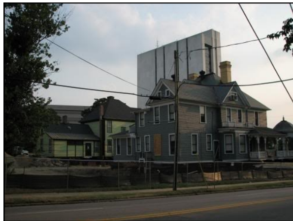
The Jordan House in 2008 prepped to be moved to its current location on the corner of Peace and Blount.

Almighty God, we give you thanks for the provision of the Peace Street property , and we pray that you would provide us with all the resources necessary to establish our church home on this site. As we move to the edge of downtown give us grace to faithfully bear witness to the good news of Jesus Christ, and use us to transform the heart of the city for the glory of your name. Amen.